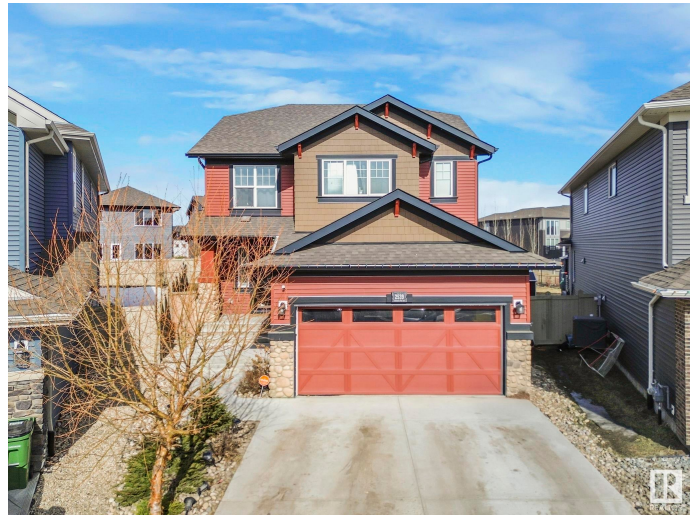
2539 Orchards Way SW, Edmonton, AB

MLS® # E4427515 Price $850,000 Bedrooms 6