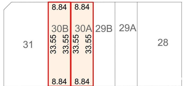
LOT DIMENSION DETAILS