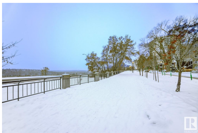
1701-11710 100 Ave NW, Edmonton, AB