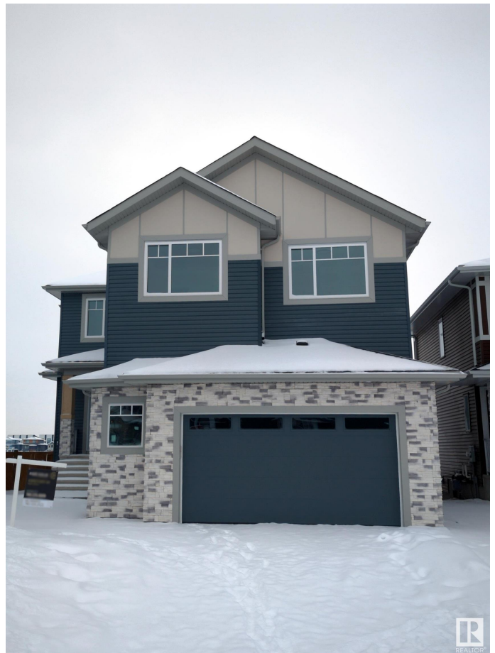
91 Edgefield Wy, St. Albert, AB

2 Storey 2,848 +/- SF on a Walk-Out lot onto the Pond. Fully fenced and Landscaped Plus 1,193 +/- SF Bsmt developed. TOTAL 4,041 +/- SF developed. Designed for family enjoyment plus large gatherings! Enjoy tranquility watching the Sunset over the pond. Covered deck off Dining Room, Primary Suite and at ground level patio. Huge Spa style Ensuite - separate water closet. Double vanity. Invigorate in the spa shower or relax in the huge soaker tub. 3 additional Bedrooms on the same floor all with 4 Pce Bathrooms. Plus, main floor den/bedroom with adjacent full bath. 5th Large Bsmt. Bdrm. Large Kitchen Plus a full 2nd Kitchen. Entertain guests in the Living Room while others relax in the Bonus Room overlooking the Great Room or bsmt family room c/w wet bar w bar stool height island or enjoy the games room. Open design allows flow of natural light thru-out. Store your toys™ in the oversized garage. Access to the Park/Pond/Pathways. Major Shopping, Schools, Recreation Facilities, Major/Minor Arterial Roads